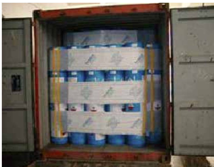
Good transportation protection (Ty-Gard)