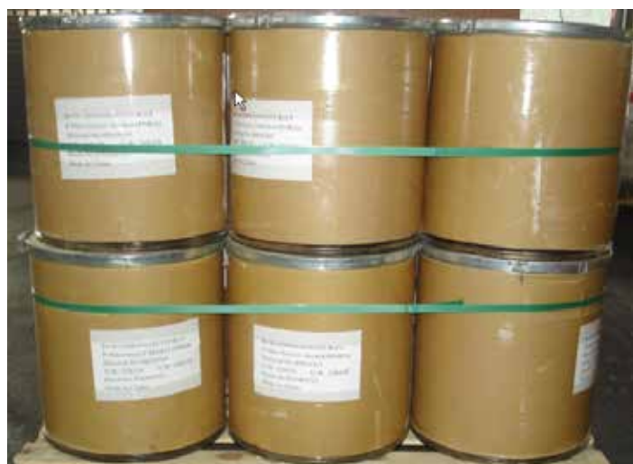
Good transportation protection