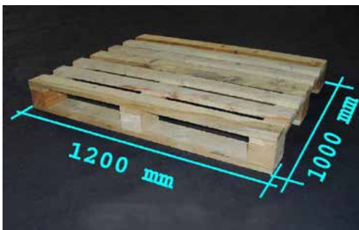
Pallet – 1 000 × 1 200 mm