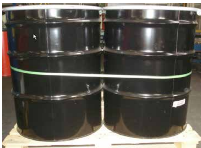
Good transportation protection