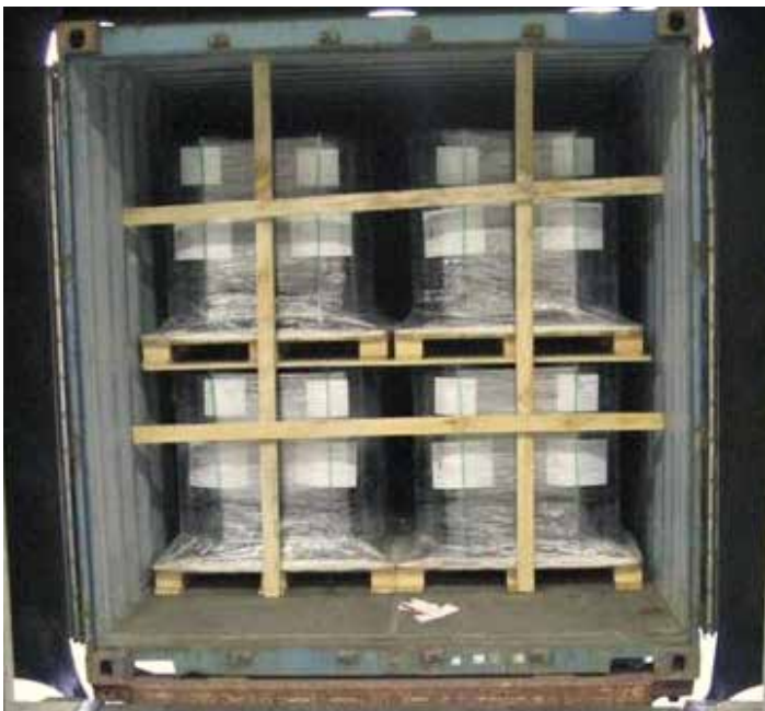
Good transportation protection