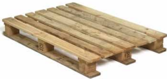
Pallet Typ CP 2 – 800 × 1 200 mm

Oversize of the boards over the blocks on the long side is not allowed. This would lead to problems in our conveying system. The stability of this pallet is not sufficient.