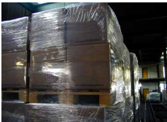
Good transportation protection