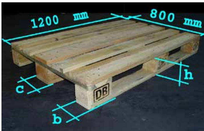
Pallet – 800 × 1 200 mm, i.e. EPAL

Only the pallets described as follows can be accepted: