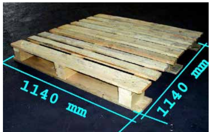
Chemical Pallet Typ CP 3 – 1 140 × 1 140 mm Oversize of the boards over the blocks on the long side is allowed for this type of pallets